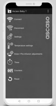
AscasoApp. Total control

Energy efficiency. We deliver a 50% average saving compared with a traditional machine and 25% compared with other multiboiler machines.