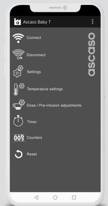
AscasoApp. Total control

Energy efficiency. We deliver a 50% average saving compared with a traditional machine and 25% compared with other multiboiler machines.