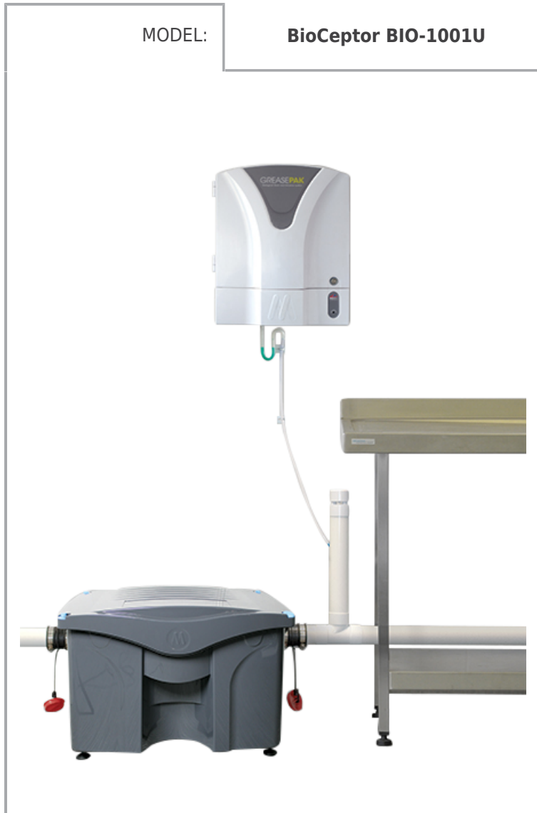
BioCeptor F.I.T Unit: