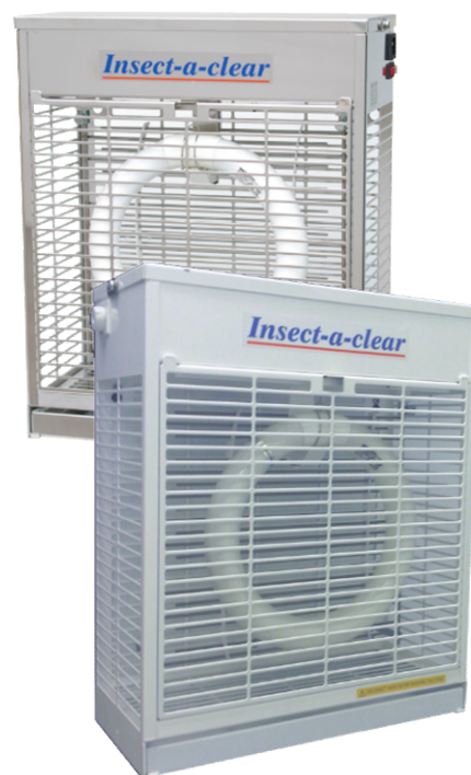
Actual size W 32 x H 39.5 x D 15 cm

All models can be wall mounted, free standing or suspended..