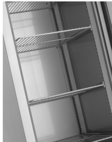
Non-Gastronorm Shelving System With Anti-Tilt Slides

Precision's durable all stainless steel cabinets have been designed to provide commercial caterers with reliable, energy and cost efficient refrigerated storage solutions. Proudly made in the UK, these slimline cabinets are capable of meeting the highest demands of commercial kitchens all around the world - especially when space is at a premium.